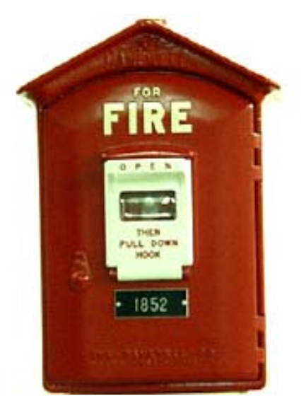
Three-Fold Fire Alarm Box